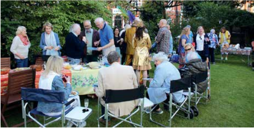
The guest table at our annual summer BBQ

Our annual 'bring your own' summer BBQ and disco in the garden square had excellent attendance in June. We started earlier at 5.00pm so that the children could meet our local Earl's Court police and play with some of the things they brought along (see page 26).